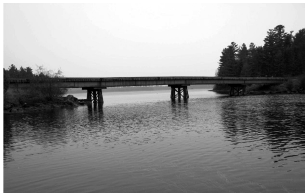
This October 2020 photo shows the Johns Bridge, which spans the Allagash Wilderness Waterway in northern Maine. The bridge was the site in September 2002 of a van accident that killed fourteen migrant workers.

"from away." In 2002 approximately 1,200 immigrants—mostly from Central America—came with special visas to work for Maine timber companies. Yet it took news of the Allagash tragedy for many Mainers to realize that Central American migrants were living and working among them.<sup>3</sup>