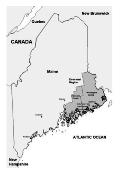
This map highlights the Downeast region of Maine. Map by Galo Falchettore.

and brush are delivered in a jumble and need to be separated. If there has been rain or snow, wreath workers are virtually handling ice all day as they bunch and twist wet and cold branches.<sup>30</sup>