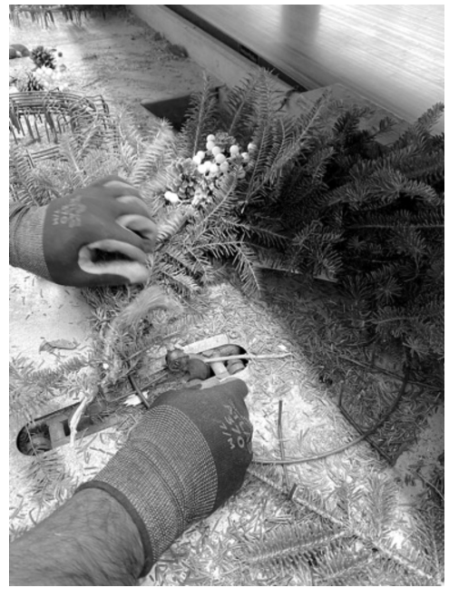
In the photograph above, a wreath worker in Maine uses a mechanical clamp to secure groups of branches. The photograph on the facing page shows a bundle of finished wreaths with worker tags attached.

for, and how much they pay workers. I was making giant wreaths. . . . selling [online] for $100 apiece. I was being paid $1 for them!" she remarked. 31